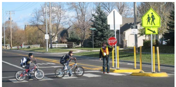
This pedestrian refuge island was added in Bozeman, Montana in 2007 after deficiencies were found during a walking audit.