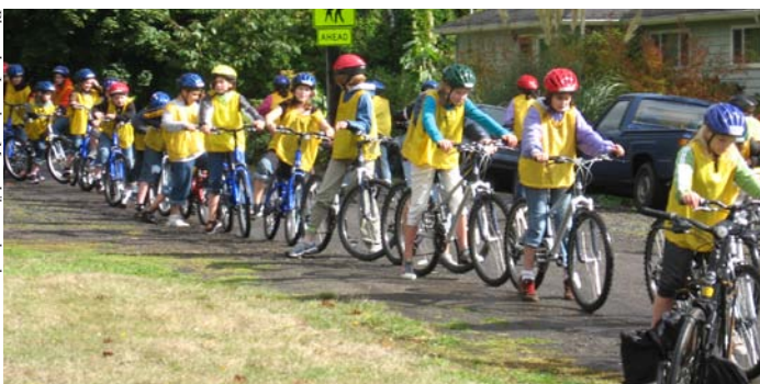
Alta manages the City of Portland's pilot Safer Routes to School program, in collaboration with the Bicycle Transportation Alliance, Community Cycling Center, Willamette Pedestrian Coalition, and the Oregon Alliance for Community Traffic Safety.