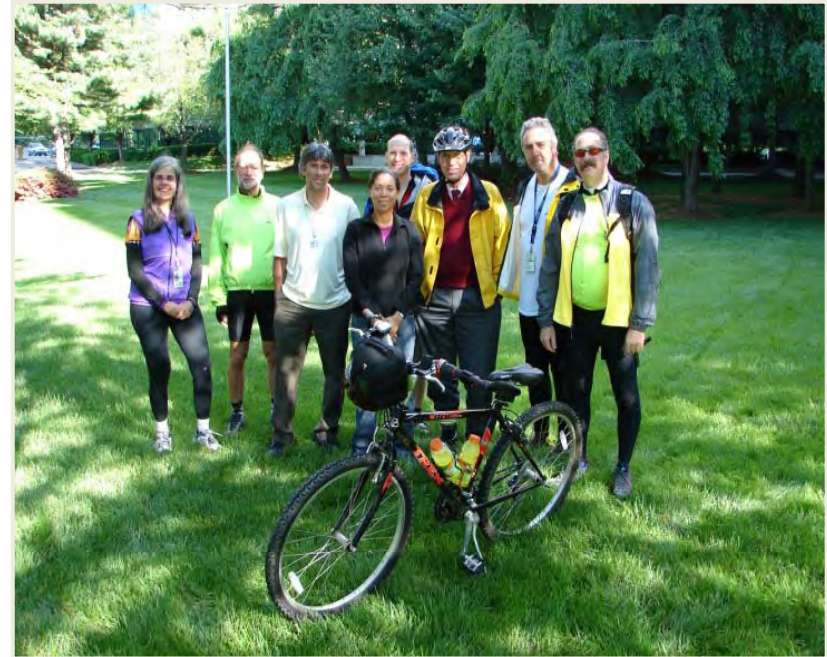
“Car Free Day” festivities