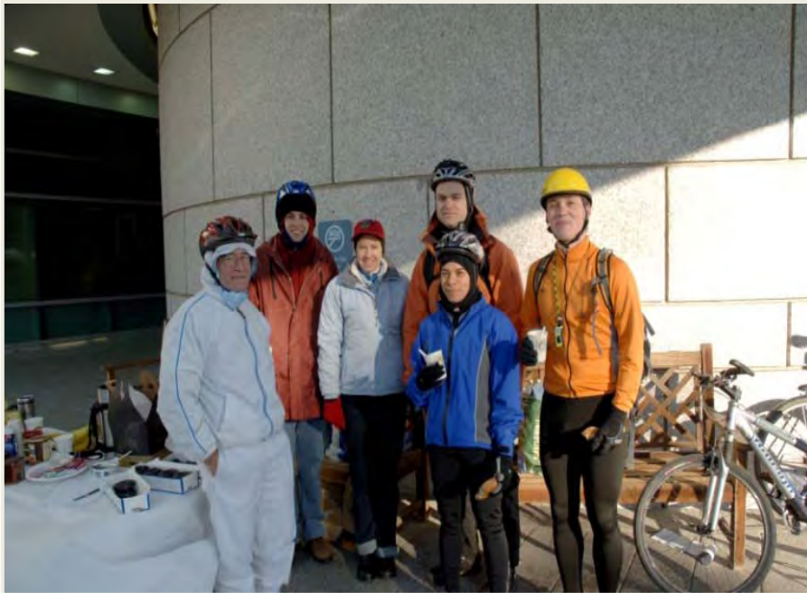
Seasonal “Polar bear” receptions