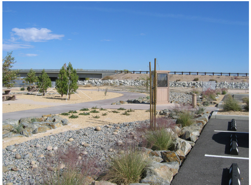
Alta designed this trailhead for the Amargosa Creek Trailhead and Pathway in Lancaster, California. It includes custom furniture, signage, a parking lot, and a restroom.

Our dozens of trailheads are functional and beloved places for gathering, celebration, and connection.