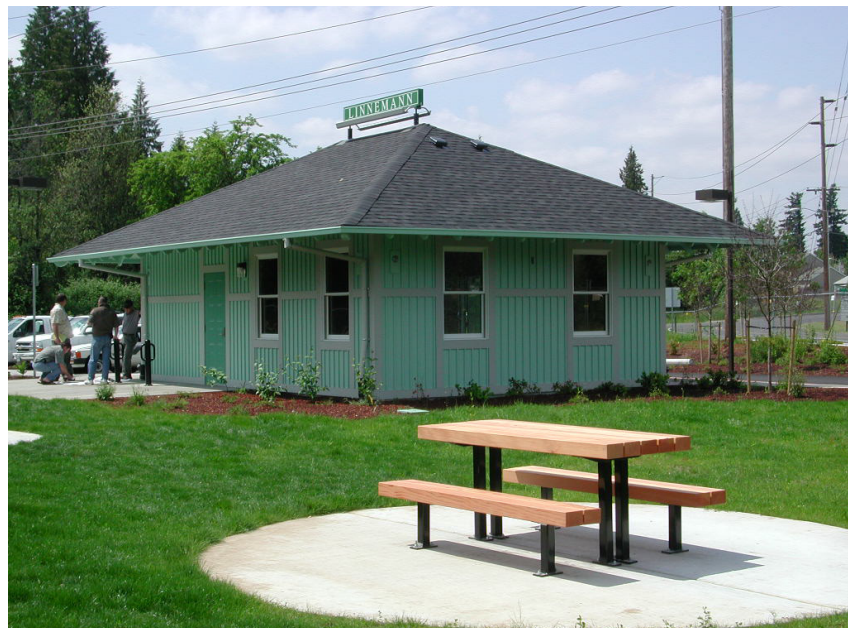
Linneman Station, designed as part of Alta's Phase V improvements to the Springwater Corridor in Oregon, includes this trailhead, which features equestrian trailer parking and a museum designed to capture the essence of the historic Linneman Station building.