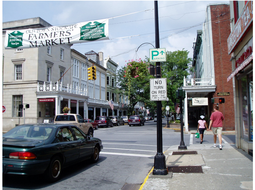
Rural hamlets and Main Streets were a key element of Alta's Ulster County, New York, Non-Motorized Transportation Plan.