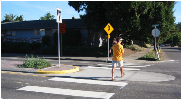
For the Tacoma Street Main Street project in Portland, Oregon, Alta proposed new and improved pedestrian crossings, landscaping, parallel bicycle boulevards, and signage.