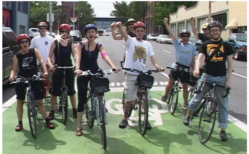
Innovative treatments like colored bike boxes provide safety for cyclists riding to and from campus.