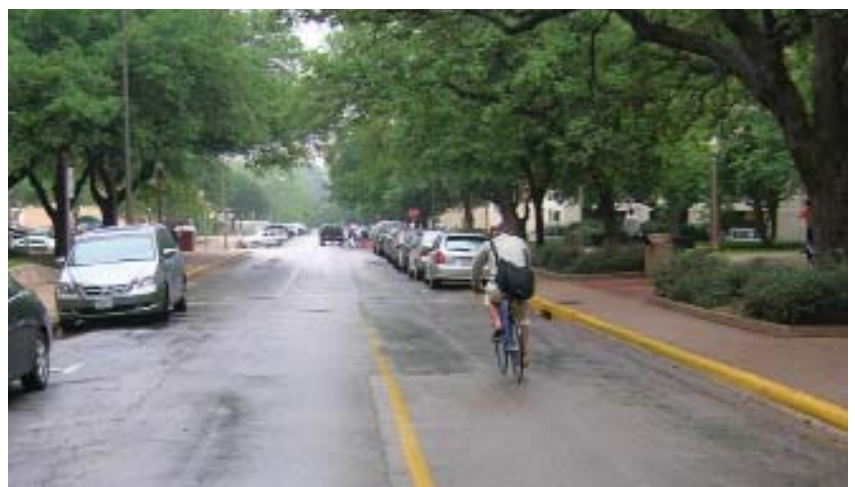
Alta's UT Austin Campus Bicycle Plan includes an extensive on- and off-street bikeway network leading bicyclists to and through the campus.